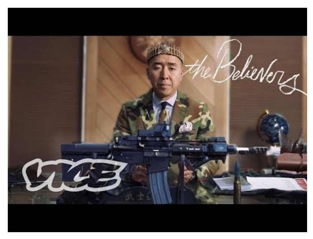
Watch Video At: https://youtu.be/ArfGyo6HQ E

Moon's church, which imagines the "Rod of Iron" in the Bible's Book of Revelations as a modern-day AR-15 and <u>Jesus Christ as a manufacturer of assault weapons</u>, is an example of an extremist group that, despite being somewhat insular and fringe, operates in lockstep with the broader far-right and GOP when it comes to fighting the culture war du jour.