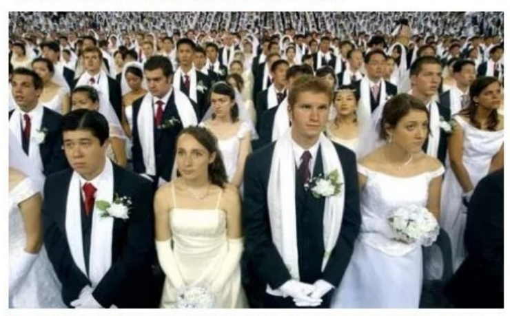
Some 3,600 couples attend a Unification Church ceremony at a gymnasium in Seoul.

Sun Myung Moon, the founder of the Unification church known globally as the Moonies, has handed over control of the movement to his Harvardeducated youngest son in what is being seen as an attempt to broaden the controversial religious organisation's appeal.