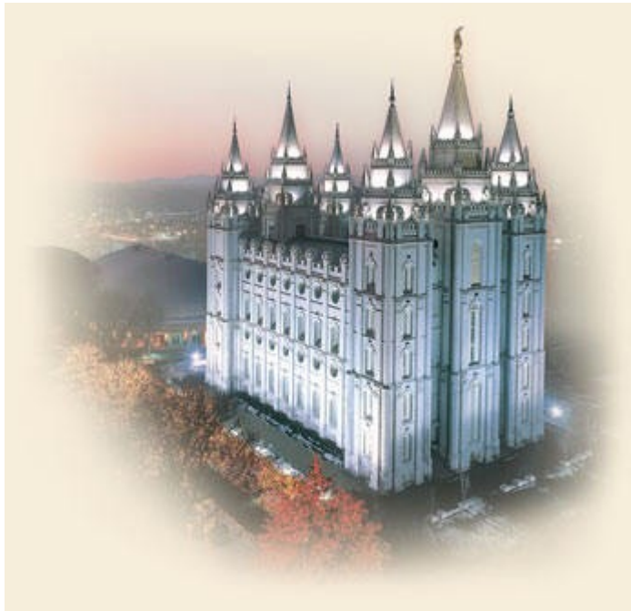
Mormon Goat Barn In Salt Lake City Utah