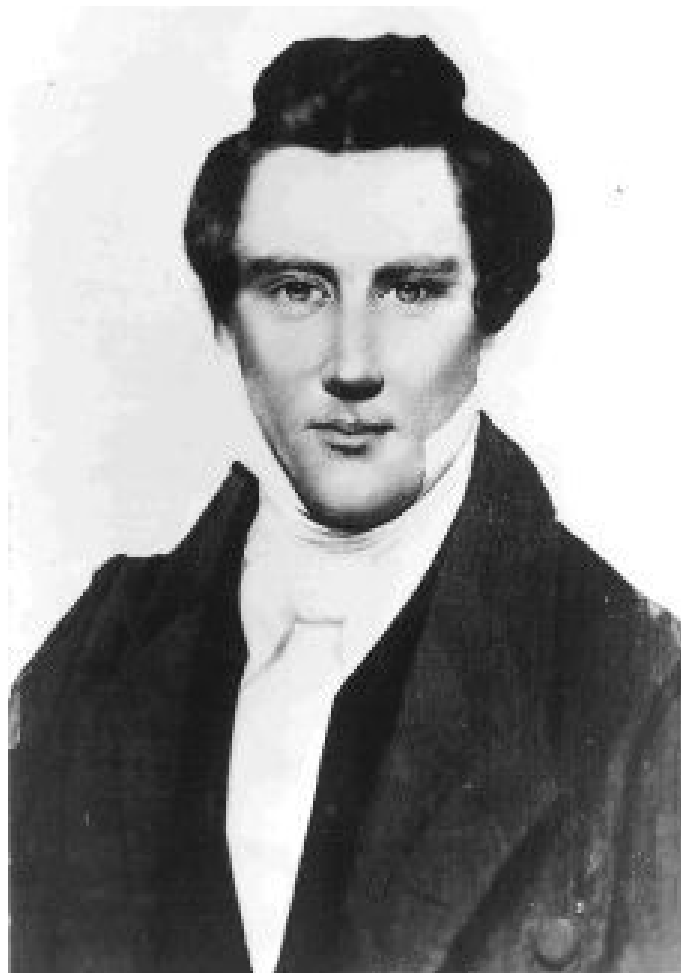
Joseph Smith Freemason Polygamist/False Prophet Who Founded The Mormon Cult