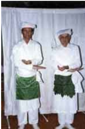
Mormons dressed in "sacred Mormon garb" doing their sacred masonic rituals borrowed from Joseph Smiths Freemasonic ritualism