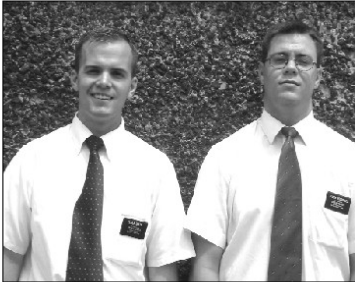
Mormon Missionaries - Cookie Cutter Pharisees Sent From The Demon Moroni With Burning "Bosoms"