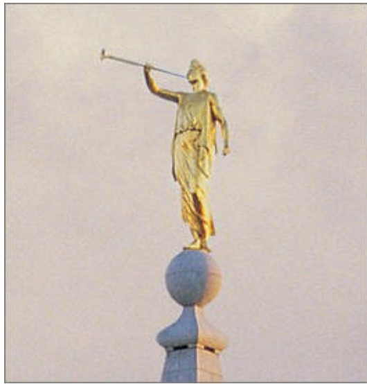
Demonic Harbinger Atop Mormon Temple