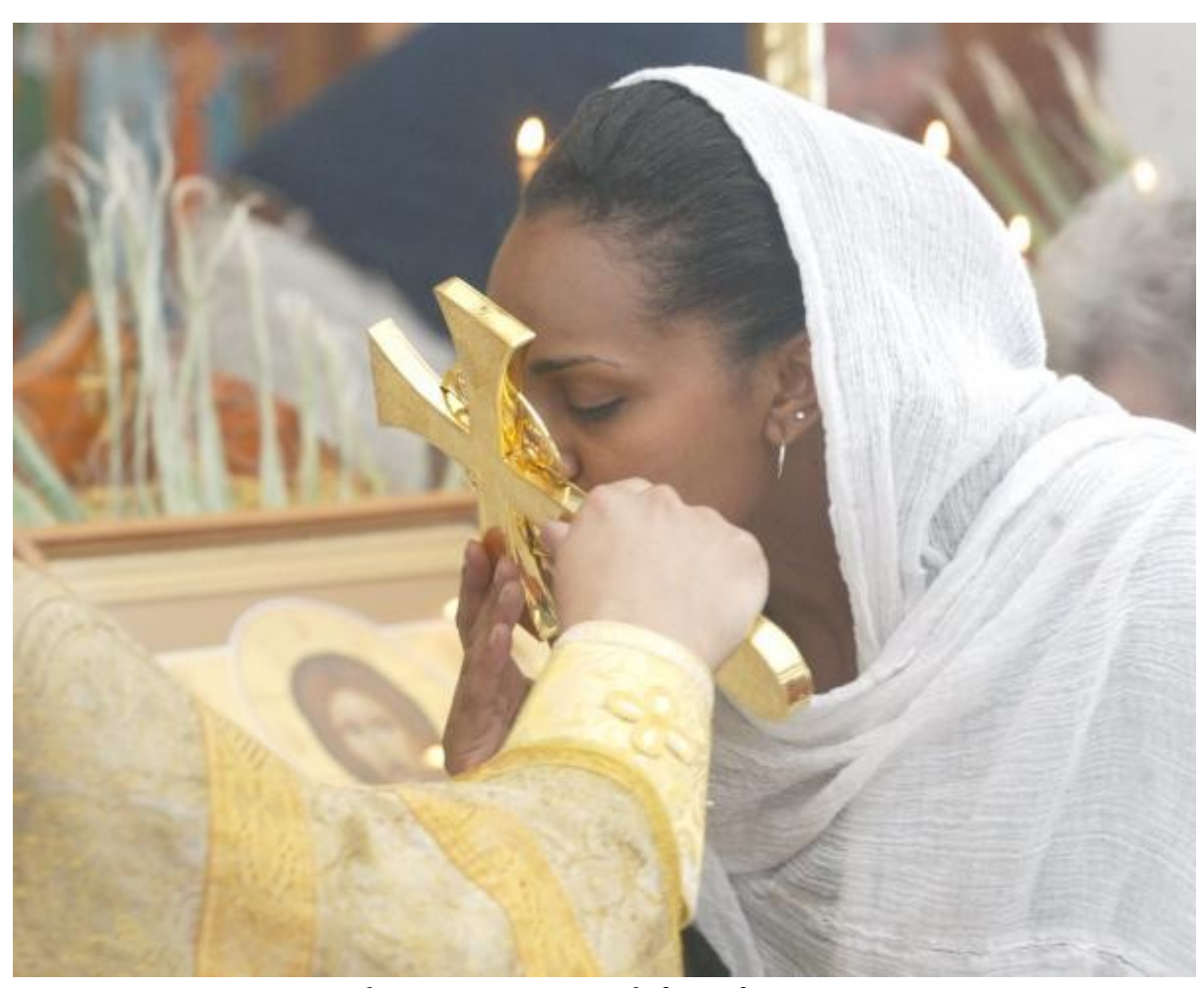
People are worshipping Satan and Don't Even Realize it