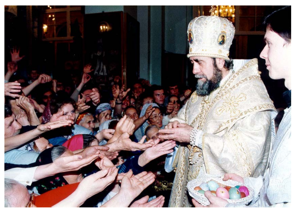
These people have religion without Christ.

"And ye will not come to me, that ye might have life." -Jesus Christ (John 5:40)