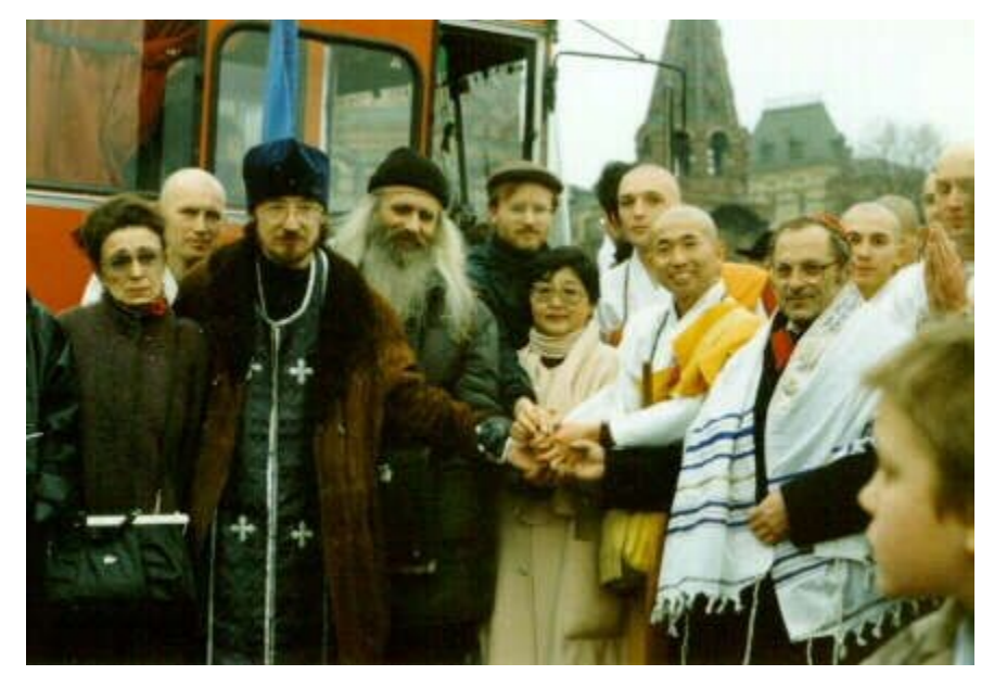
The Orthodox church is 100% ecumenical - just like Roman Catholics!

The Dangers of Ecumenism and The Modern Ecumenical Movement