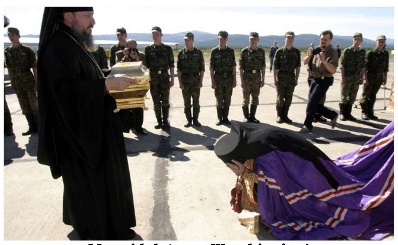
More idolatrous Worshipping!

"...I fell down to worship before the feet of the angel which shewed me these things. Then saith he unto me, See thou do it not: for I am thy fellowservant, and of thy brethren the prophets, and of them which keep the sayings of this book: worship God." -Revelation 22:8, 9