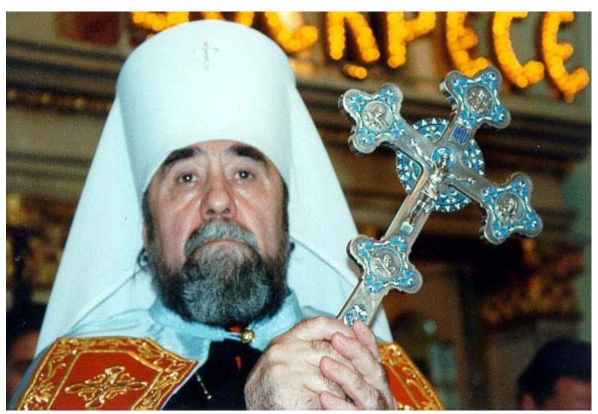
Notice the Illuminati "Skull and Bones" Emblem on the cross