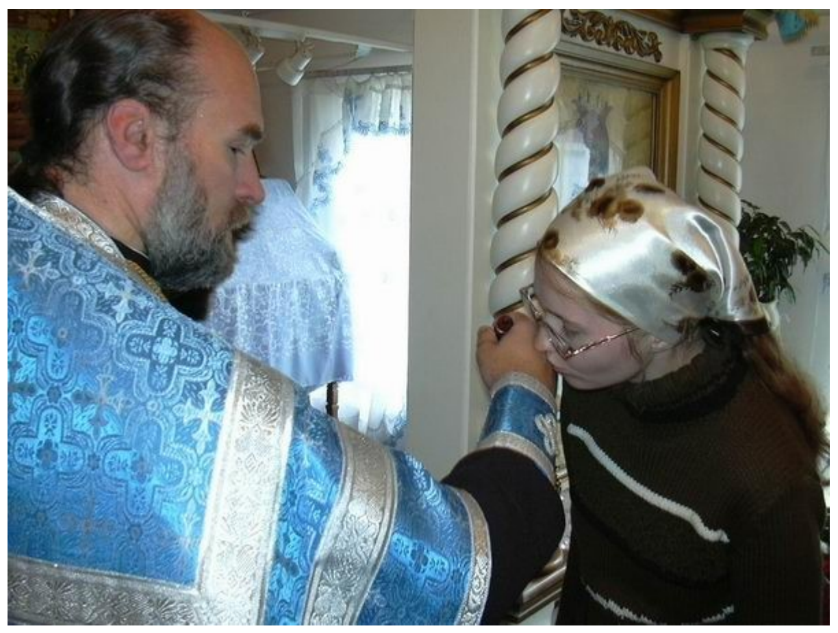
Kissing a Russian Orthodox priest's hand!

"Wives, submit yourselves unto your own husbands, as it is fit in the Lord." -Colossians 3:18