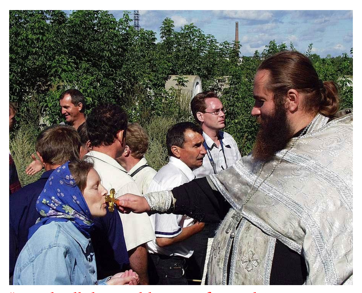
"...with all deceivableness of unrighteousness in them that perish; because they received not the love of the truth, that they might be saved." -2nd Thessalonians 2:10