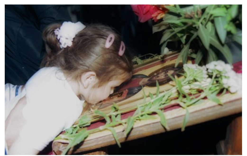
Little girl being forced to kiss an icon