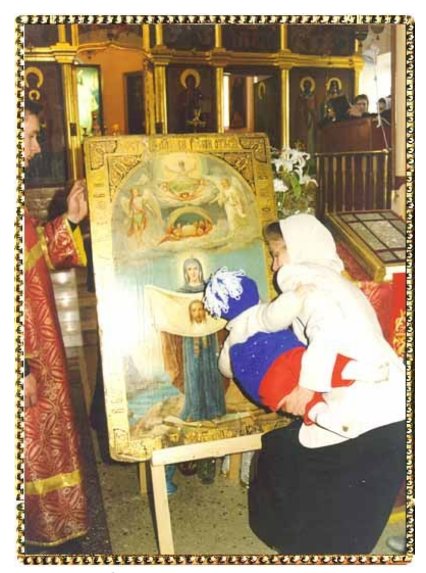
Come on my son, kiss the Queen of Heaven!

"Ye worship ye know not what..." -John 4:22