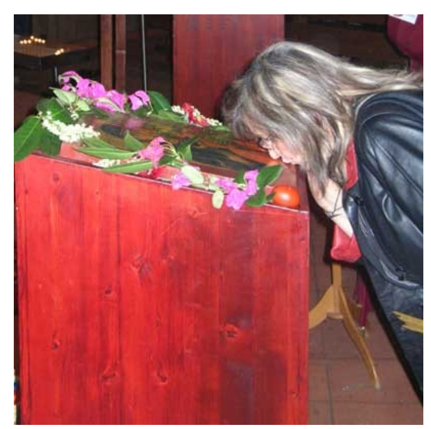
Kissing an icon