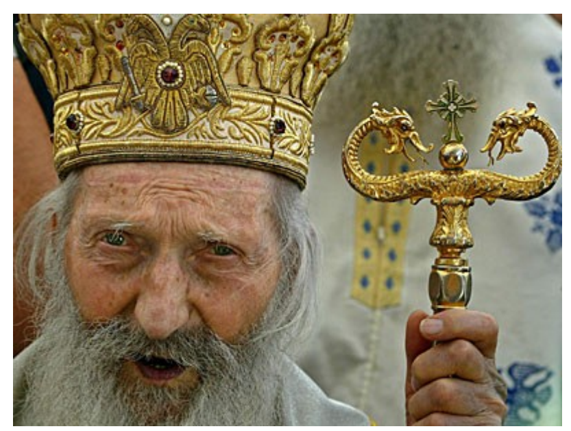
The crazy "Patriarch" and his two dragons! Also: Notice the Phoenix birdies on his hat.

"Woe unto you, scribes and Pharisees, hypocrites! for ye compass sea and land to make one proselyte, and when he is made, ye make him twofold more the child of hell than yourselves." -Matthew 23:15