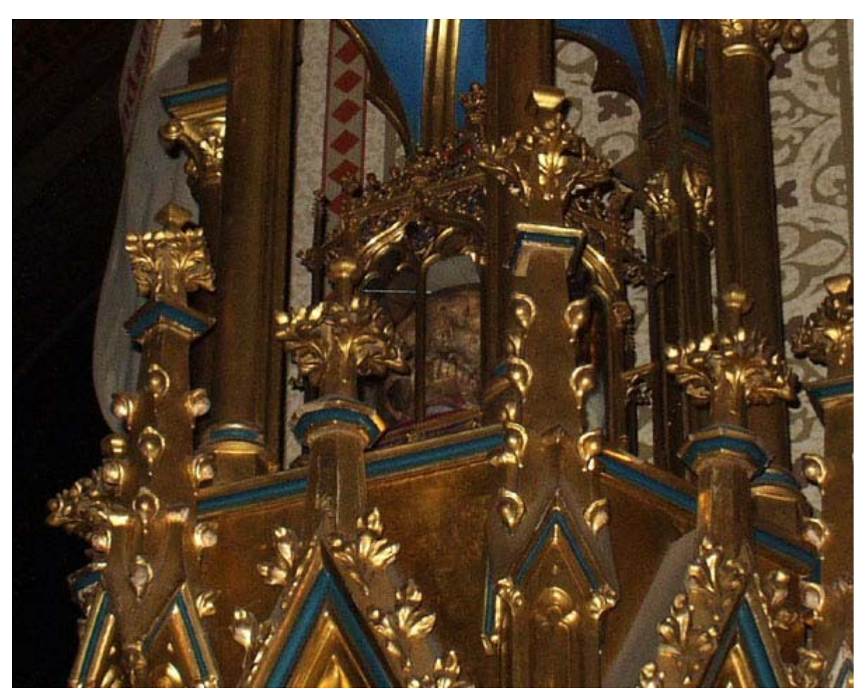
Skull display when it is not being worshipped