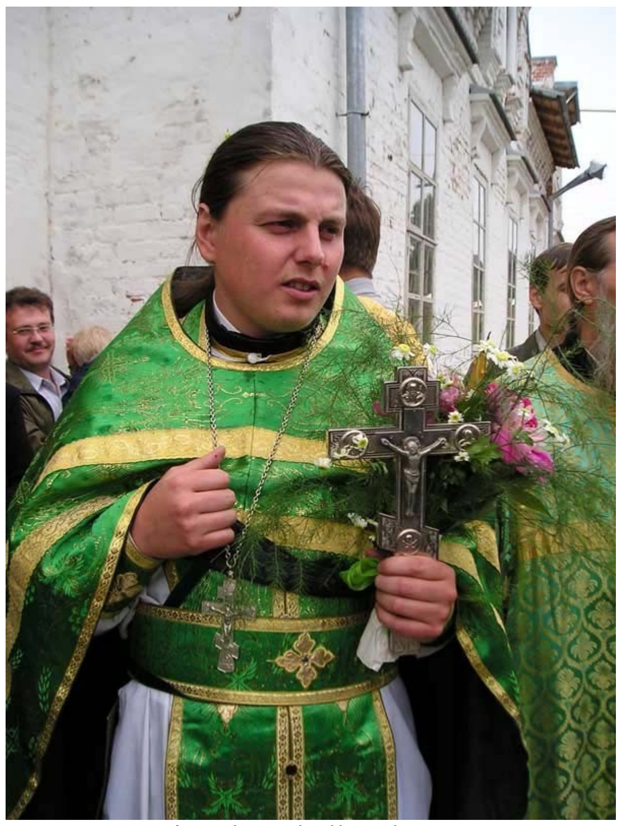
Notice the "Skull and Bones" on the cross the priest is holding