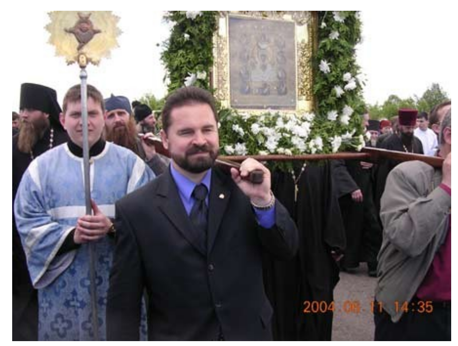
The icons are worshipped more than Jesus. Some of those icons are of mystics (meaning Satan-possessed) like Sergei Radonevzhski

"Little children, keep yourselves from idols. Amen." -1John 5:21