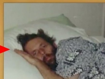
Frisbee died in 1993 at age 43 of AIDS.