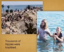
Thousands of hippies were baptized.